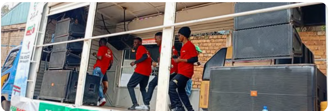
Plotika Campaign Road Show in Nakuru

But it's more than just prizes. Every plot purchased during the campaign contributes to our CSR initiative, sponsoring school fees for needy students. Together, we're investing in communities and building a brighter future.