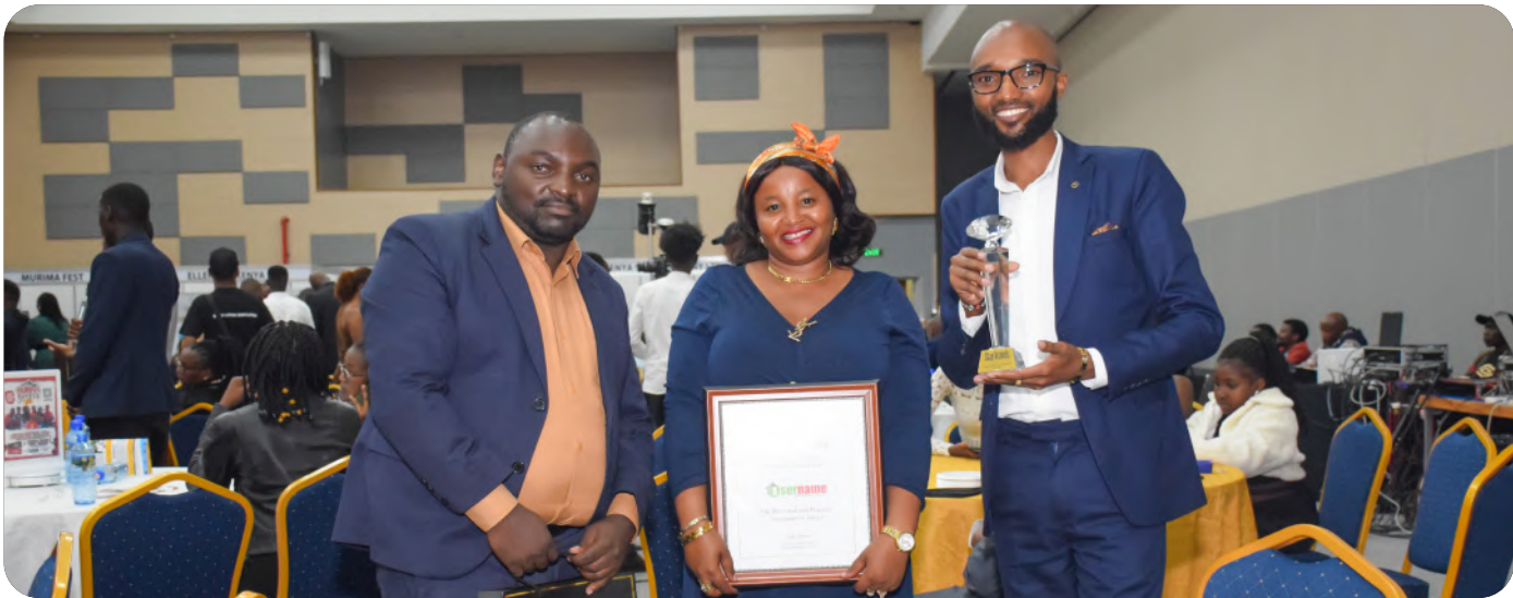
Username staff posing with Awards at the Star Brands Event