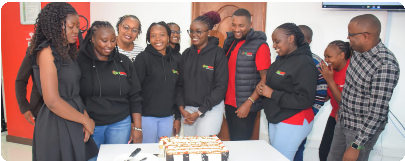
Celebrating December Babies Birthday's