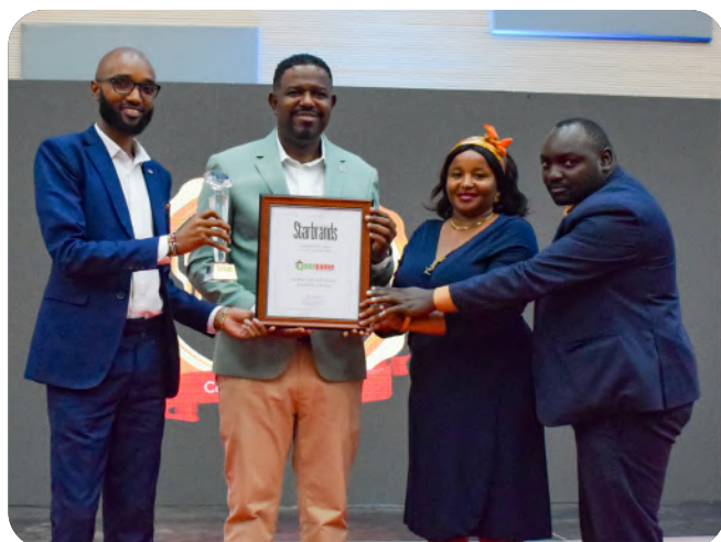
Best Land & Property Investment Company in Kenya' at the East Africa Star Brands Awards 2025