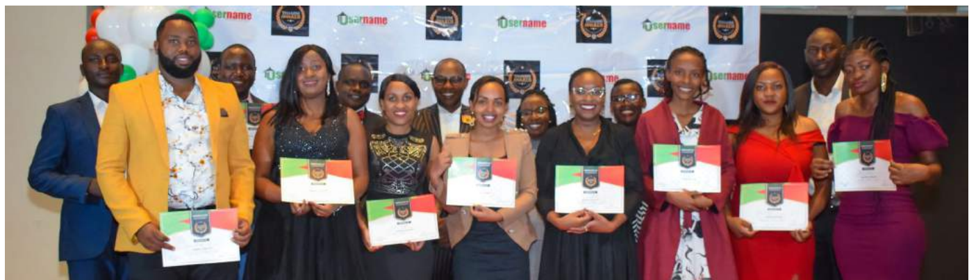
Username Investment Limited Staff Members who were awarded various prizes during Thamini Awards

Thamini Awards is an Annual Internal Human Resource Program that seeks to recognize and reward the outstanding performance of Username Investment staff.