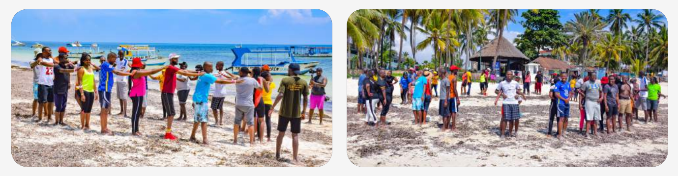
Username Team Engaging in Different Activities