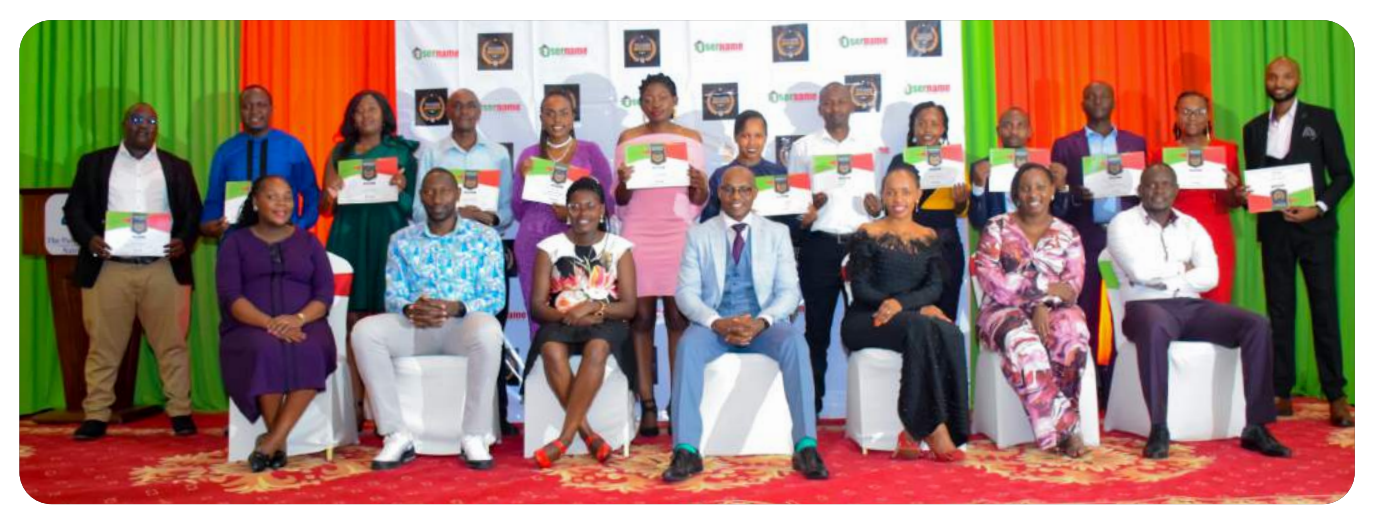
Username Investment Limited Staff Members Who were Awarded Various Prizes during Thamini Awards