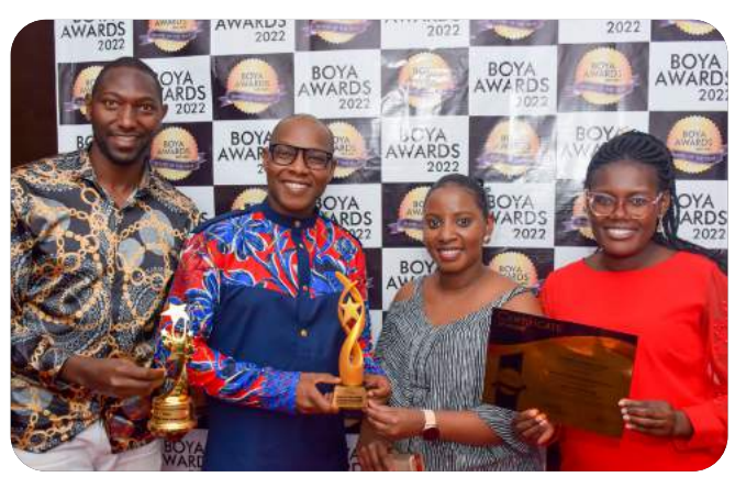
Username Investments awarded the Most Trusted and Reliable Land Selling Brand in Kenya