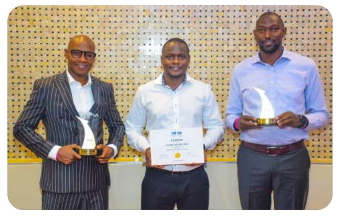
Username Investments Directors Pose with The 2 Awards Won by The Company