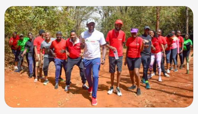
Username Investments Team During a Run at Karura Forest