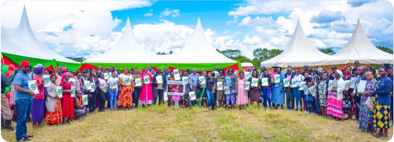
Successful land investors pose with their title deeds after the issuance ceremony