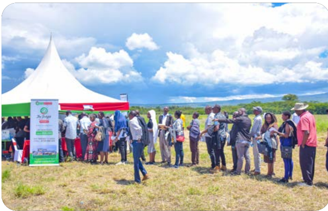
Land investors eagerly line up to receive title deeds to their purchased land