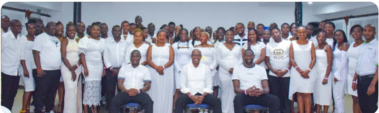
Username staff posing for a photo