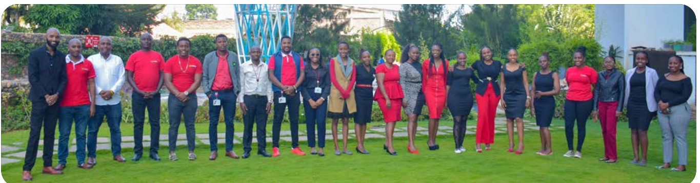
Username staff pose for a photo during Valentines Day