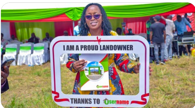
Investors posing with their Title Deeds